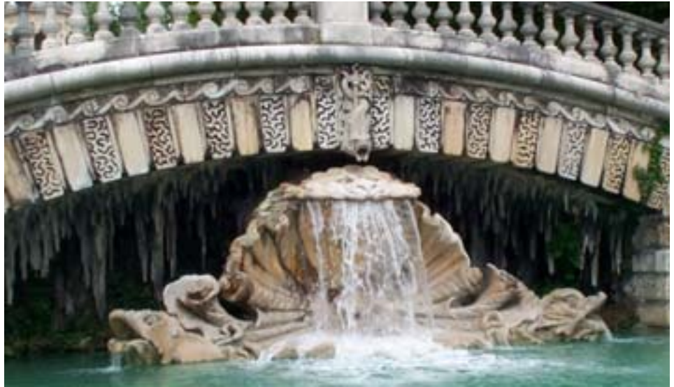
Fountain at Place Darcy in Dijon, France.

In 2004, the American Foundation for Translation and Interpretation awarded her the S. Edmund Berger Prize for Excellence in Scientific and Technical Translation for the English translation of Darcy's book.