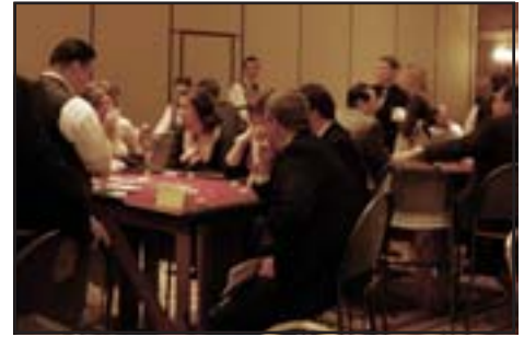
Banquet guests enjoyed casino gaming, dinner and dancing.

The banquet capped a busy month for the Engineering community which included PE Day at the Capitol and the annual MATHCOUNTS competition at U.T. Austin.