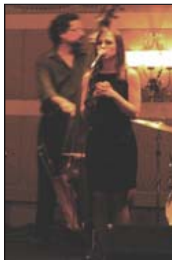
Singer Kat Edmonson and her band provided live music for the evening.